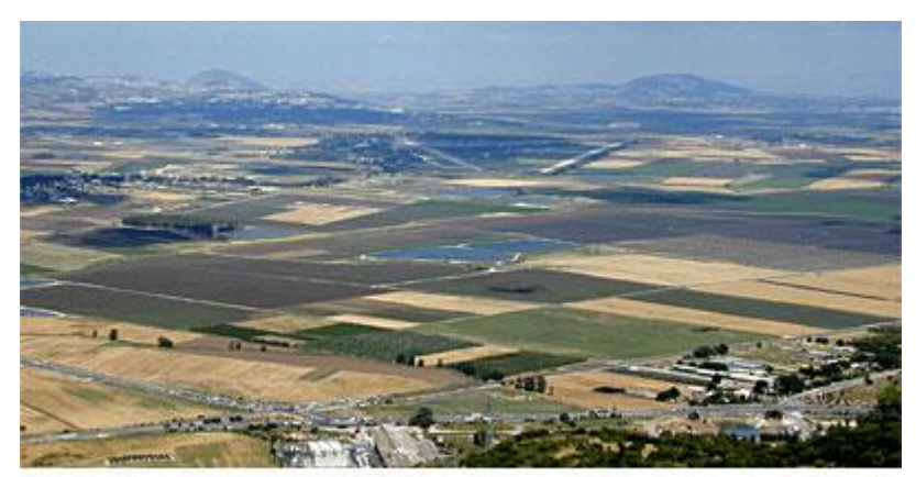
The Valley of Armageddon looking east from the top of Mount Carmel

The concept comes from the book of Revelation where it says that armies will gather in the end times at a place "which in Hebrew is called Har-Magedon" (Revelation 16:16). This term literally means the Mount of Megiddo and refers to the ancient fortress of Megiddo that controlled the Valley of Jezreel. In English the word was transliterated as Armageddon, and the term came to be applied to the Valley of Jezreel which lies in front of Har-Magedon, running diagonally across Israel from Haifa to the Jordan River.