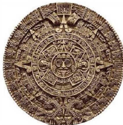
A Mayan Calendar

The Mayas had three main calendars. 3 One was a solar calendar that was based on 20 day months. The second was a ceremonial calendar that was related to the 260 day cycle of Venus. It was their third measure of time, the Long Count Calendar, that was related to the year 2012.