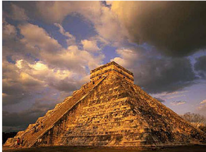
The Mayan stepped pyramid at Chichen Itza